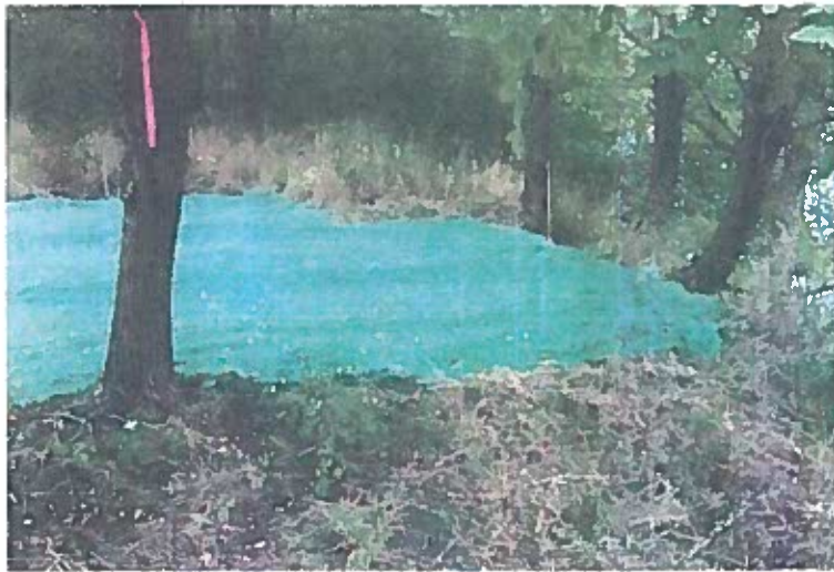
Photo 6 – Area 3, after repair work was completed. View is from the northwest.