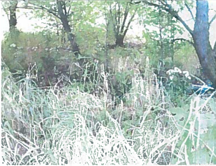
Photo 5 – Area 3, before any work was conducted. View is from the south.