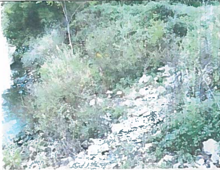
Photo 1 – Area 1, before any work was conducted. View is from the east.