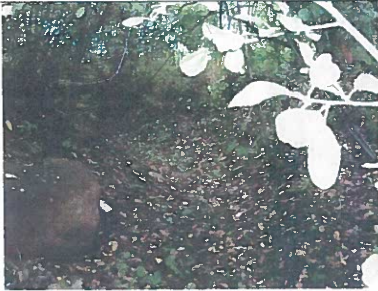
Photo 3 – Area 2, before any work was conducted. View is from the south.