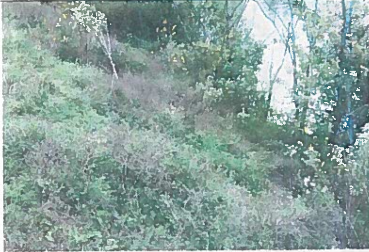
Photo 13 - Area 6B, before any work was conducted. View is from the west.