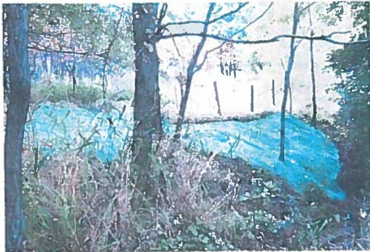
Photo 8 - Area 4, after repair work was completed. View is from the southwest.