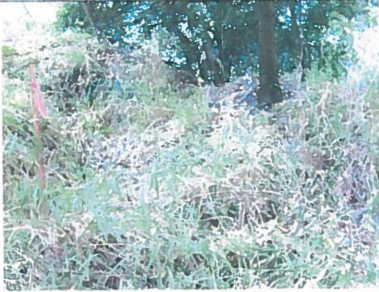
Photo 7 - Area 4, before any work was conducted. View is from the northwest.