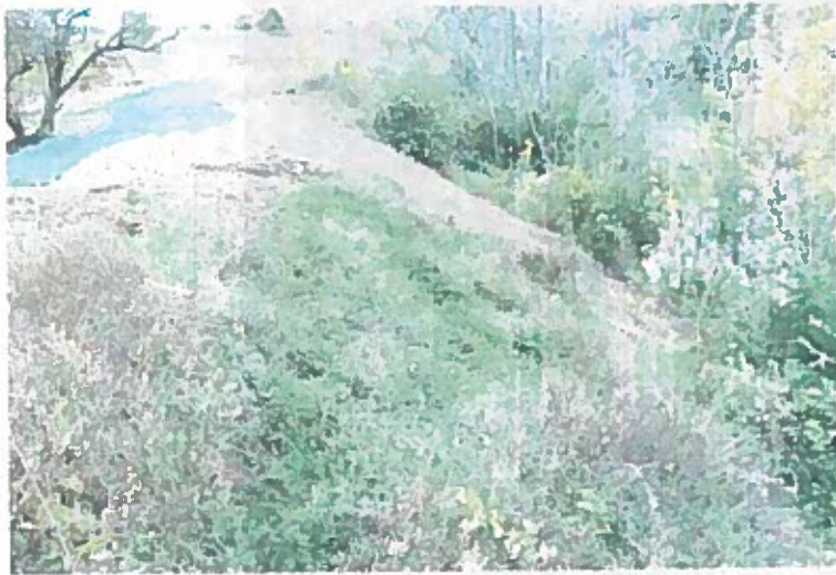
Photo 12 - Area 6B, after repair work was completed. View is from the west.