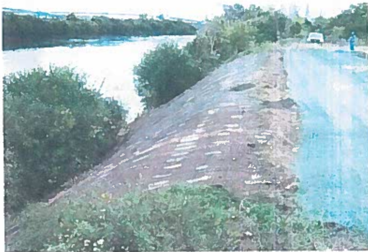
Photo 12 - Area 6A, after repair work was completed. View is from the east.