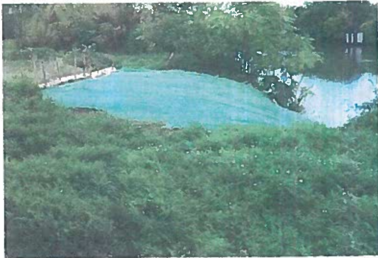
Photo 2 – Area 2, after repair work was completed. View is from the west.