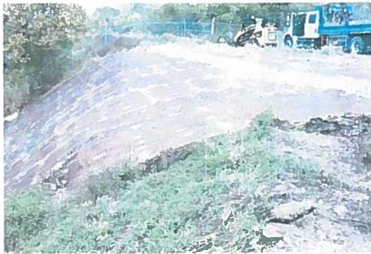
Photo 10 – Area 5, after repair work was completed. View is from the southeast.