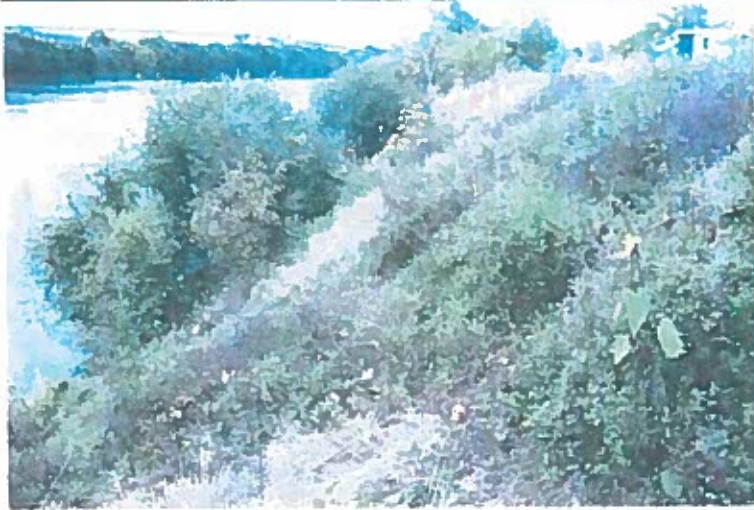
Photo 11 - Area 6A, before any work was conducted. View is from the east.