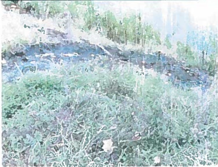
Photo 9 – Area 5, before any work was conducted. View is from the northwest.